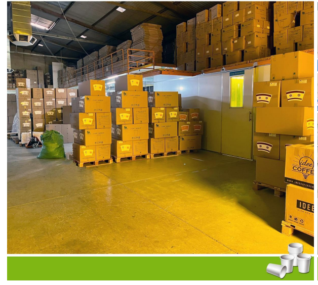
Ly Giấy Việt Nam